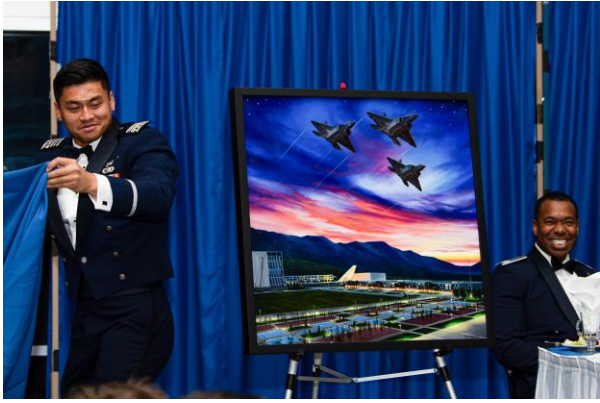
U.S. Air Force Academy Class of 2024 unveils official class painting, featuring F-22s in flight