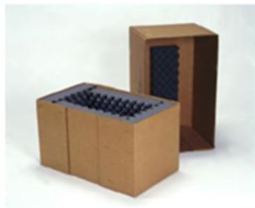
Figure 2-3: Multi-Application Container Examples

Multi-Application containers are designed to protect a variety of components within a given fragility and size range. Short life multi-application containers include "fast packs," consisting of a family of standard size cushioned fiberboard shipping containers of four types. A complete list of fast pack containers is in MIL-STD-2073-1 and is fully described in commercial standard PPP-B-1672. Packaging tests are not required when fast packs are selected. Seller is encouraged to use fast pack containers for the low labor costs of insertion and removal of items.