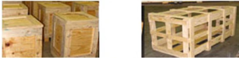
Figure 2-4: Short-Life Container Examples