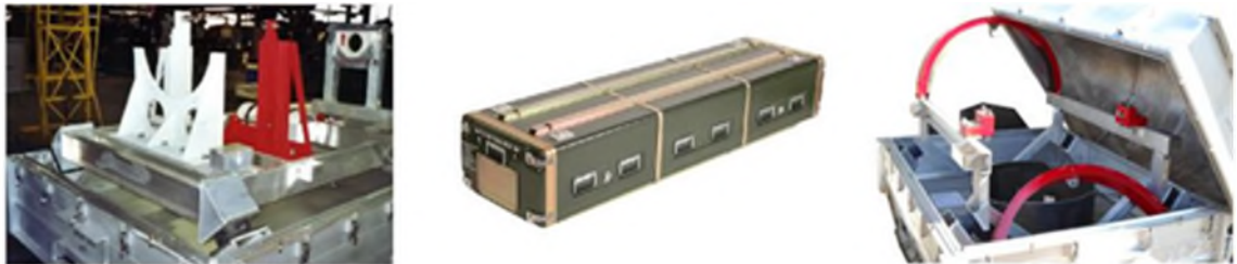
Figure 2-5: Unique Container Examples

Note Major subcontractors with preapproved packaging policy and procedures in place with Lockheed Martin (LM) do not need Buyer's Packaging Engineer approval.