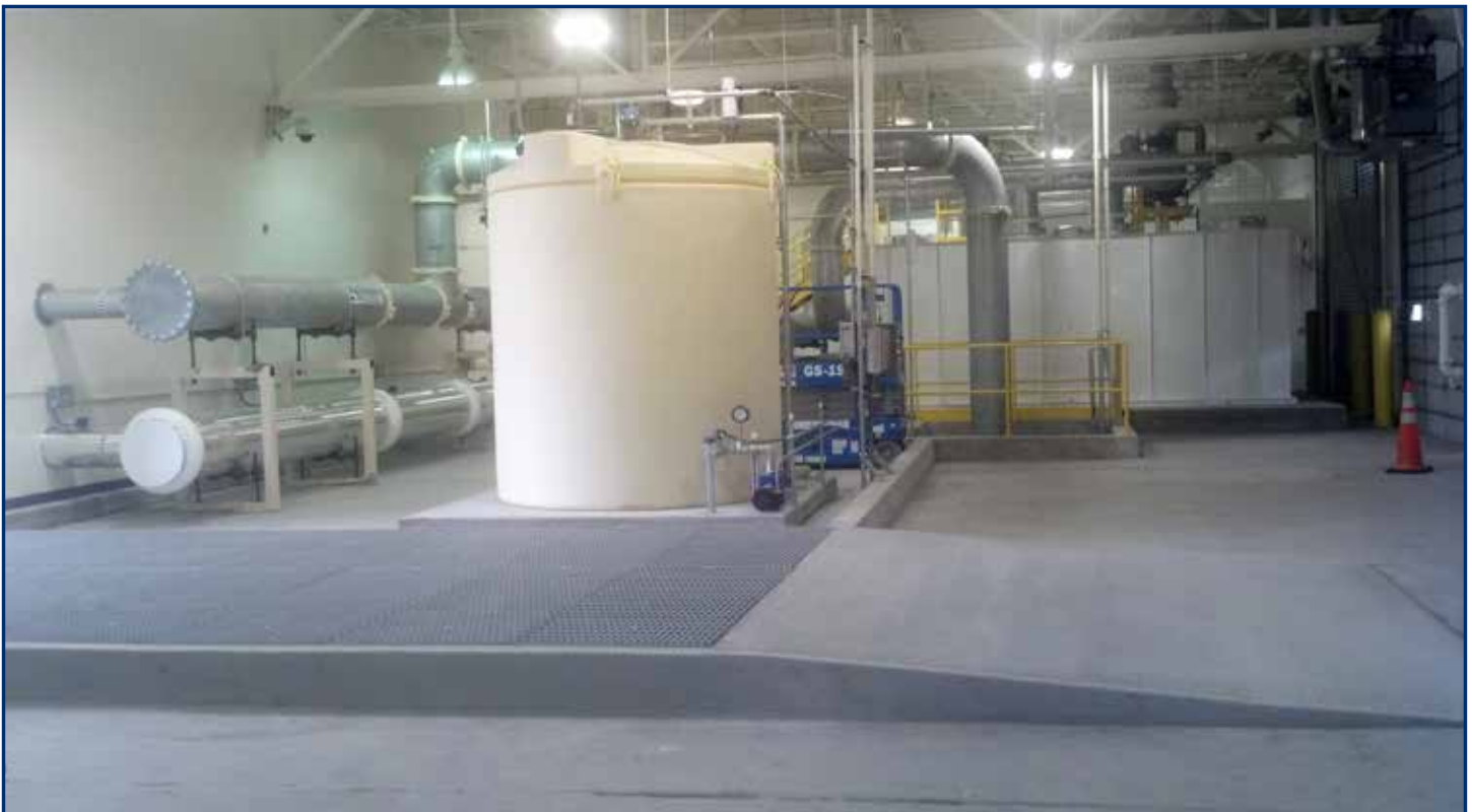
The sub-slab depressurization system (SSDS) ensures safe air quality inside the main building