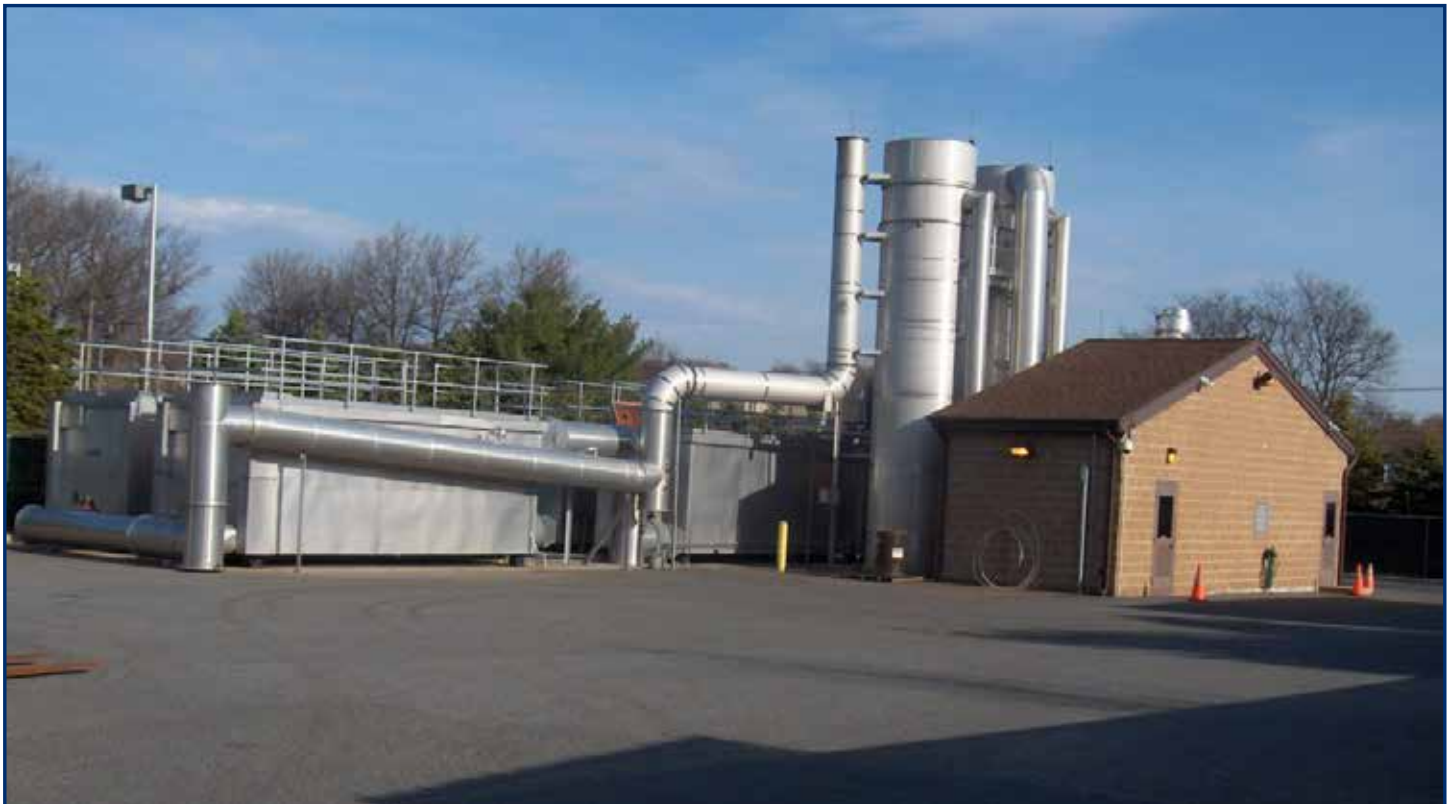
On-Site (OU1) Groundwater Treatment System