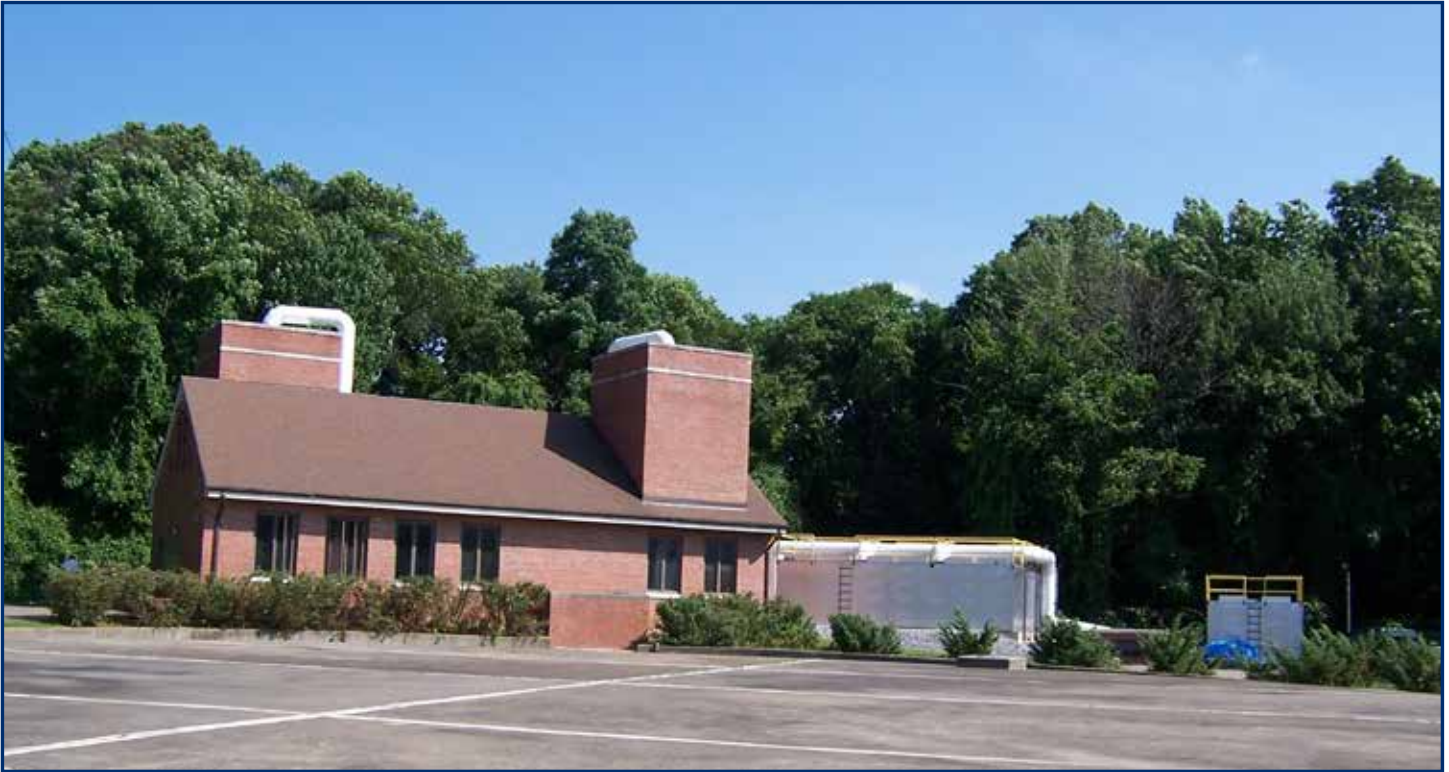
Off-Site (OU-2) Groundwater Treatment System