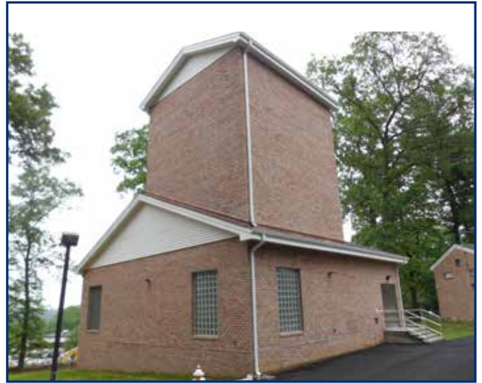
New Manhasset-Lakeville Water District water treatment facility funded by Lockheed Martin to provide clean water to their customers.

In April 1993, Unisys installed an interim groundwater treatment system (Operating Unit 1, OU1) to begin removing volatile organic compounds from the on-site groundwater at the 90-acre site's northern boundary and to contain the movement of the plume. The 1997 Record of Decision (ROD) issued by the New York State Department of Environmental Conservation (NYSDEC) directed installation of a state-of-the-art groundwater treatment system to replace the interim system. Lockheed Martin began construction of this system in 2001 and it began operation in August 2002. A separate Record of Decision for off-site groundwater, released by the NYSDEC in late 2014, approved Lockheed Martin's proposal to upgrade the capacity of OU1 from 730 gallons per minute to 850 gallons per minute by adding an additional deeper well for extracting groundwater from the plume for treatment. Design of the upgrade to the groundwater treatment plant began in 2015 and construction was completed in 2018. The system is now operating at 850 gallons per minute.