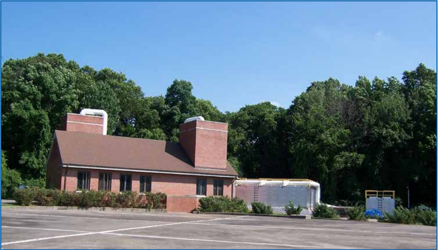
Off-Site (OU-2) Groundwater Treatment System