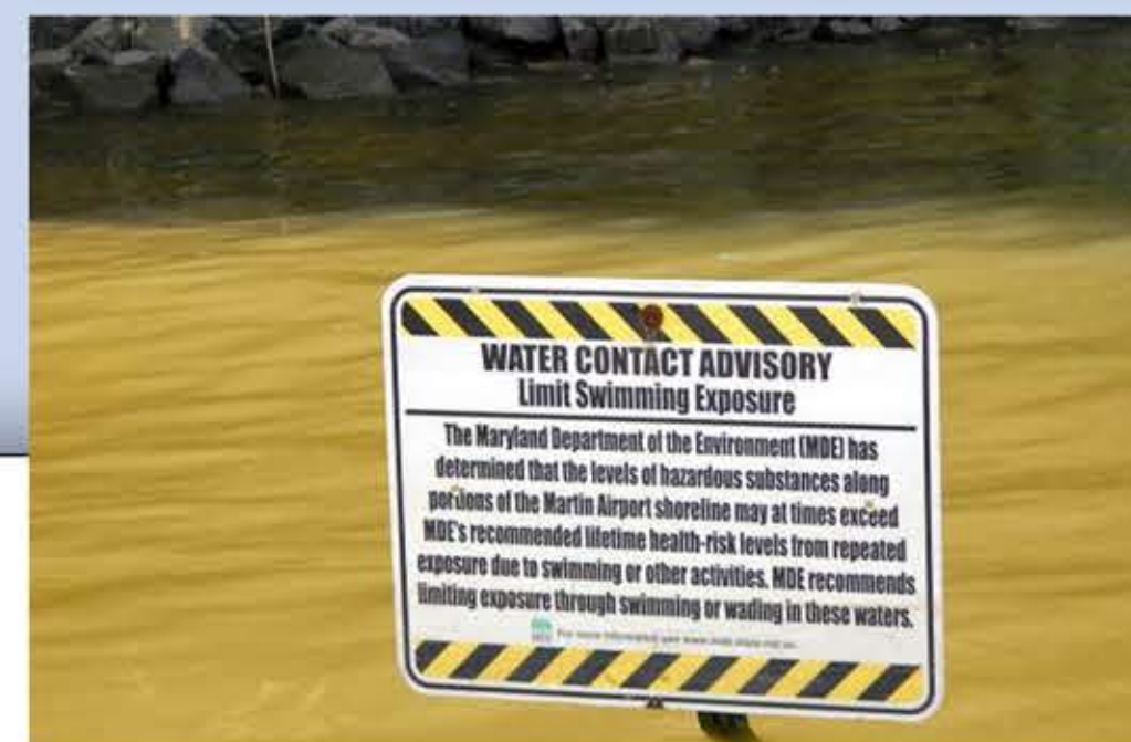
Signs have been posted at Martin State Airport advising people to limit swimming in that area.