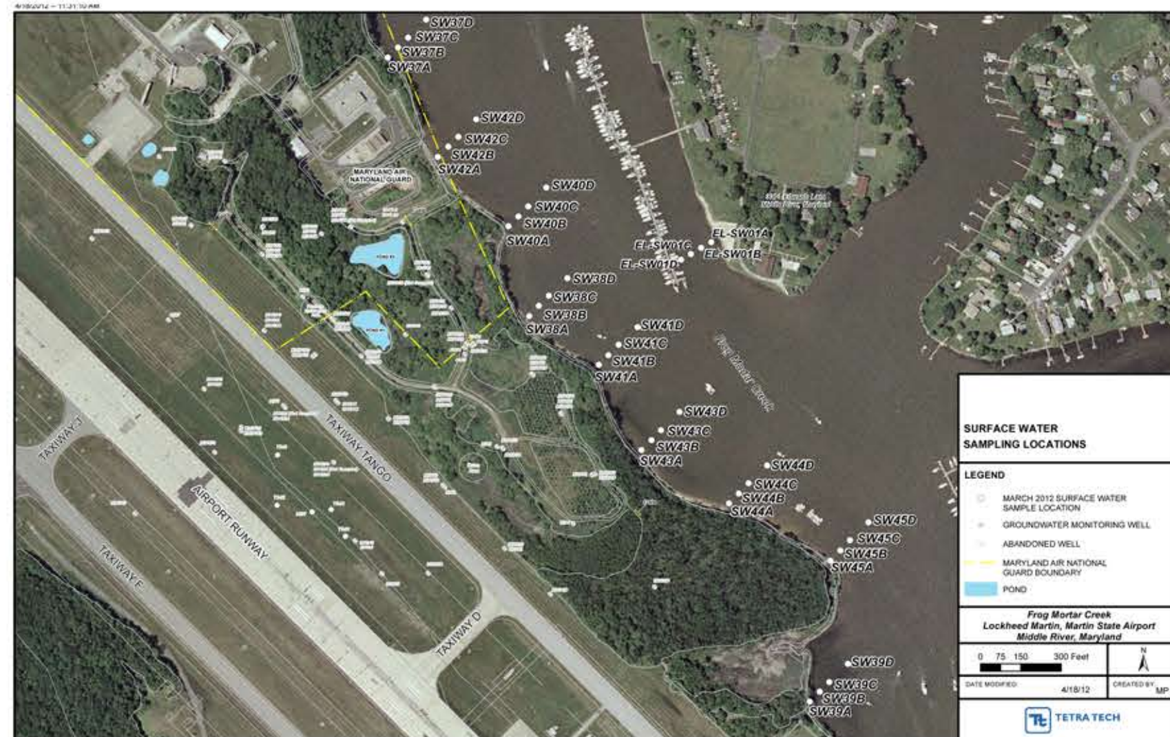
Samples are being collected at four locations: shoreline, and 50, 100 and 200 feet offshore

MDE issued a water contact advisory for Frog Mortar Creek, adjacent to the Martin State Airport. The advisory does not prohibit swimming yet leaves that decision as a personal choice of users of the area. However, it advises the public about the chemicals that are present in the creek near the Dump Road Area shoreline.