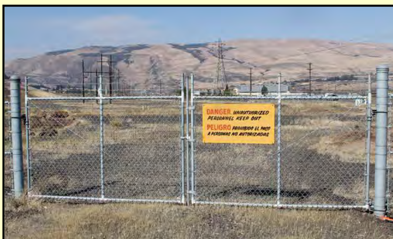
Figure 4. Types of Fencing and Signage at the Site

EPA will use the information collected from the groundwater, air, and soil sampling to determine if the remedy is working correctly.