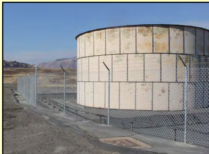
Figure 3. CERCLA Tank and Surrounding Fence

Lockheed Martin placed additional fencing and signs around the CERCLA tank in 2012. Figure 3 shows the CERCLA tank which is part of the landfill leachate collection system. Figure 4 shows examples of types of fencing and signage used at the Site.