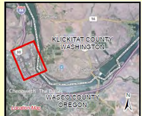
Figure 1. Location of the Site

The entire area is fenced and posted with signs warning against Site entry.