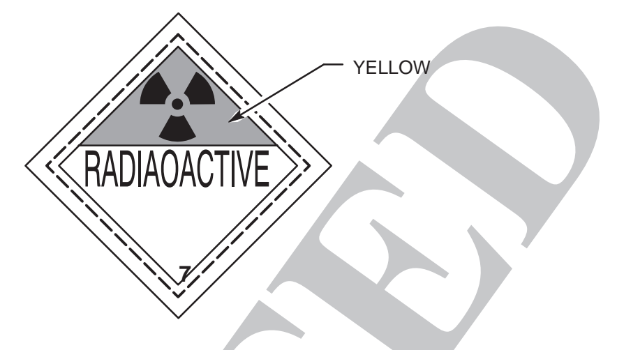
Figure 4. Radioactive Placard (Yellow) 49CFR 172.556(a)