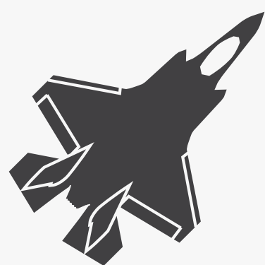
F-35 Sustainment Operations

Ohio is home to the development and production of several Lockheed Martin key mission portfolios, to include: