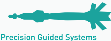
Precision Guided Systems