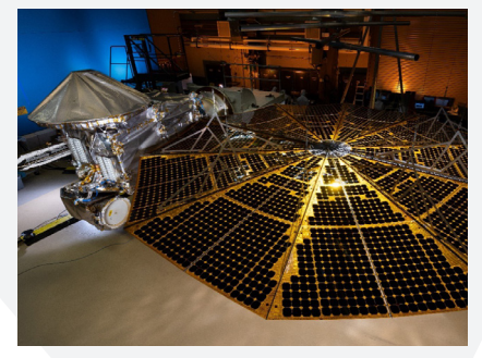
Lucy Spacecraft with single Solar Array Deployed