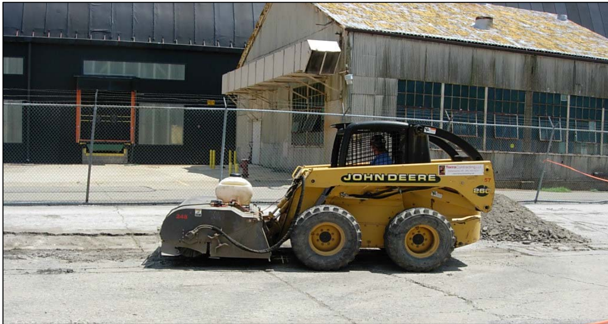
Photo 2 - Skid Steer debris removal operation

To complete the debris removal, the pavement was subsequently vacuumed using the vacuum truck equipped with a mobile chamber and hand lance. A photograph depicting this operation is in Photo 3.