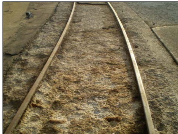
Photo 4b – Southwest Airdock door tracks close-up view after debris removal exposing underlying concrete track foundation.