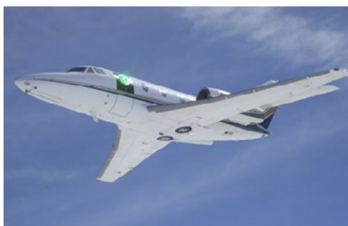
ABC Turret (Aero-adaptive Aero-optic Beam Control)