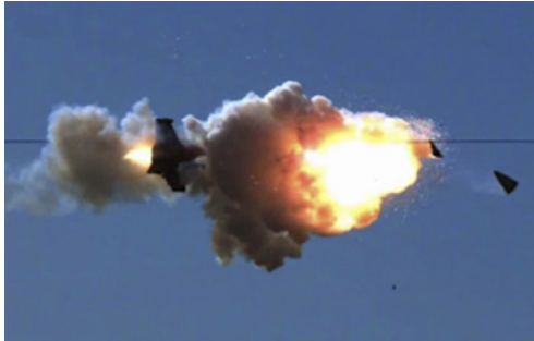
ADAM (Area Defense Anti-Munitions)