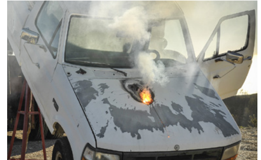
ATHENA (Advanced Test High Energy Asset)