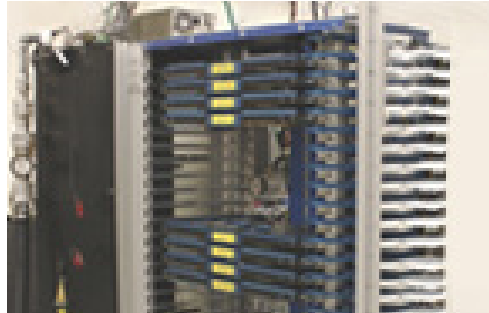
ALADIN (Accelerated Laser Demonstration Initiative)